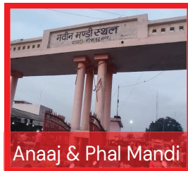
Anaaj & Phal Mandi